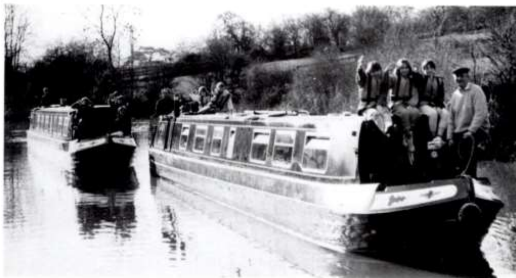
▲ Happy days on the Grand Union Canal

This is our invitation to you to book one or both of our boats for your group. Whether you are planning a holiday, a social trip or a full educational course, and whether you want to enjoy just a weekend or a full week afloat - YOU'LL BE WELCOME ON BOARD!