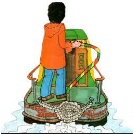
London Marina Boat Project 3 Havelock Close, Faversham, London SE13 3NF Charity Registration No. 384372

“ONE SITE INVESTIGATED WAS AN INFILL SITE AT ODMOR, NORTHANTS. IN 1989 ANOTHER POTENTIAL SITE WAS FOUND AT YARDLEY GOBION, NORTHANTS AND WHICH WAS A DESERTED FARM WITH ACREAGE DIRECTLY ADJOINING THE GRAND UNION CANAL.